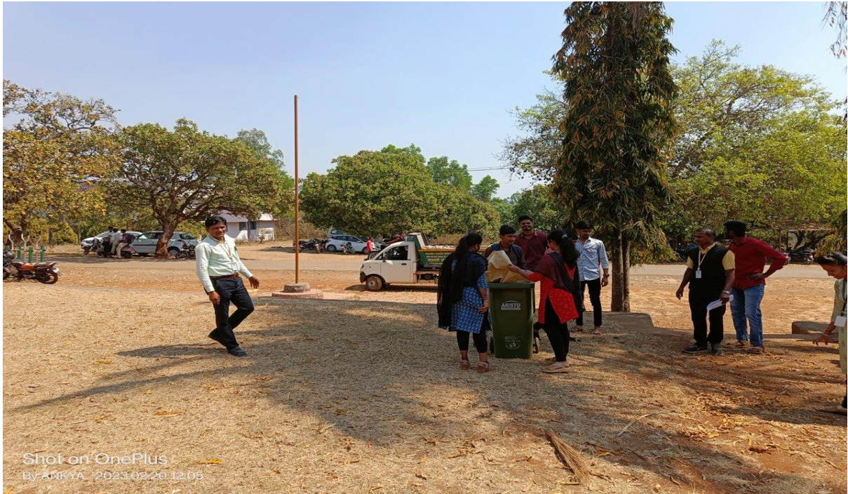
NSS Students volunteering to load waste