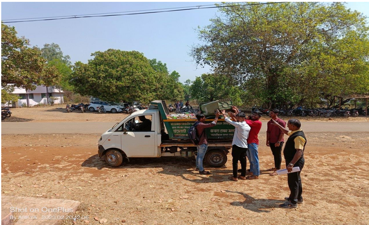
NSS Students volunteering to load waste