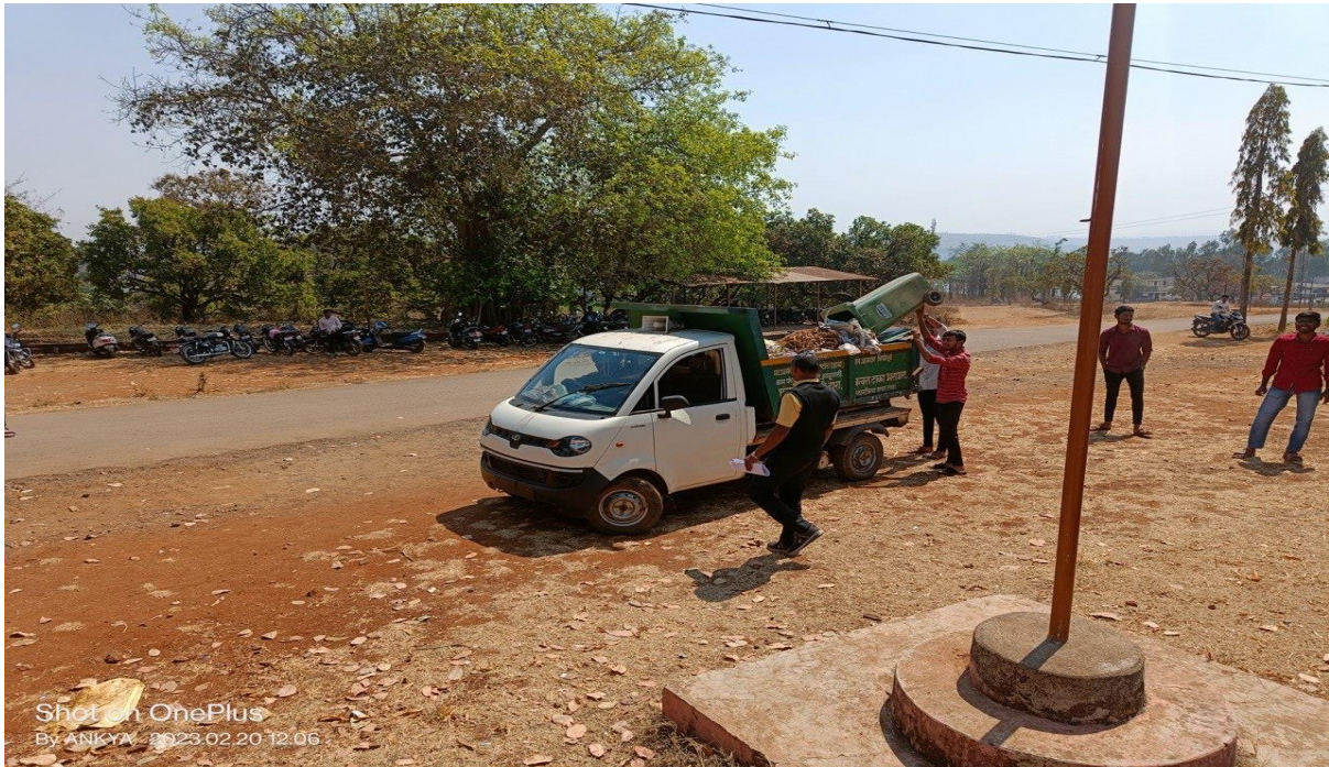
Sarud Grampanchayat employees collecting waste from college campus