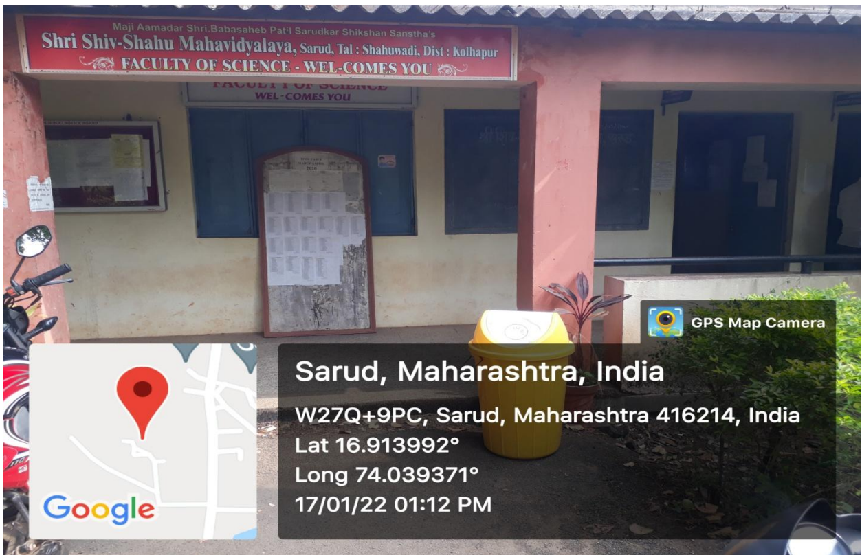
Dust bin in Science Wing